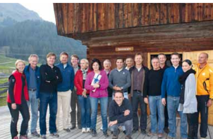
Following a workshop by company Sandoz at the Seminaralm, the team's stability was put to the test in a team biathlon competition.