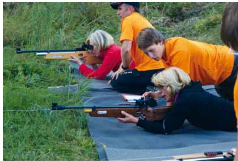
The shooting competition presents a challenge for the body and mind, requiring full concentration.

Our specially developed Summer biathlon competitions are popular programmes for promoting team spirit and utilising the strengths of each individual participant. Steadiness and precision are required for the shooting competition as well as full powers of concentration and a steady hand – which is not easy when your pulse is racing! Then it's time to conquer an obstacle course or put your stamina to the test with running, Nordic walking or biking. As you can see, the possibilities for the biathlon competitions are very varied and can be individually adapted to suit your team.