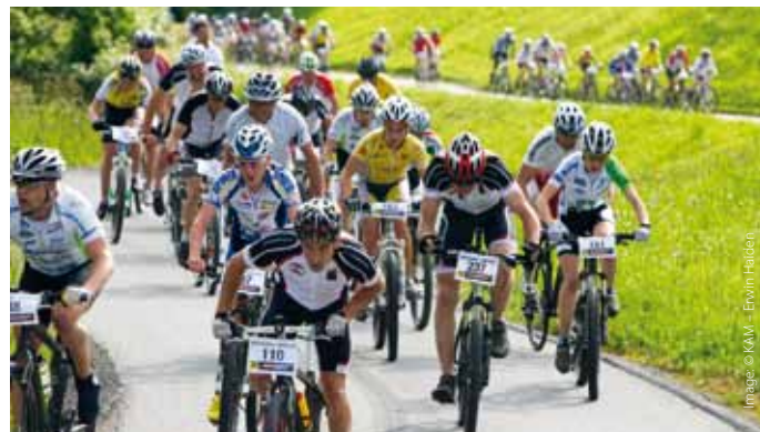
The Hillclimb brings together the world's best mountain bikers, amateur athletes and mountain bike enthusiasts.