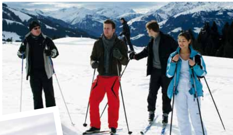
The employees of Reichhart Logistik experienced a varied and entertaining Winter's day with cross-country skiing, skiing and snow shoe walks under the motto of 'sport and pleasure'.