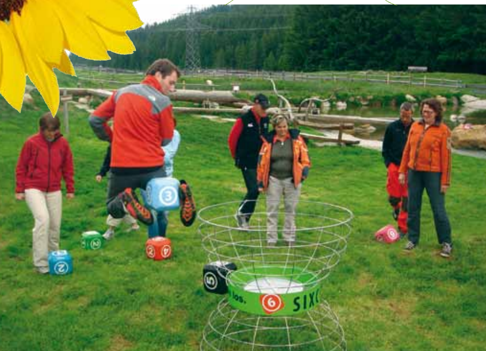
SIXCUP demands and improves the skill of the participants.

Speed, skill and happiness – with this combination, the innovative fun sport SIXCUP provides plenty of fun, excitement and entertainment. The aim is to place large foam cubes into baskets of different heights – the so-called cups – using only your feet. This new concept is particularly popular with organisation events and team building exercises as part of company seminars and incentives. The game takes various forms and can be adapted to suit the needs and requirements of the relevant players at any time, anywhere. SIXCUP reinforces team spirit and social skills and offers a special social experience.