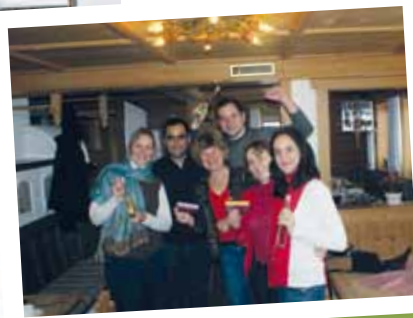
Software specialists from Kraft Food – Wintry conditions on the Melkalm