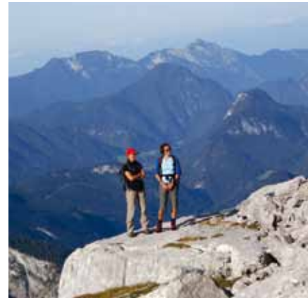
Mountain tour on the "Großes Reifhorn"