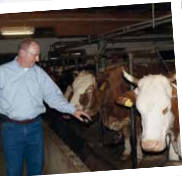
The Novartis group invited pharmaceutical sales representatives and vets from 12 countries to a meeting in the mountains.