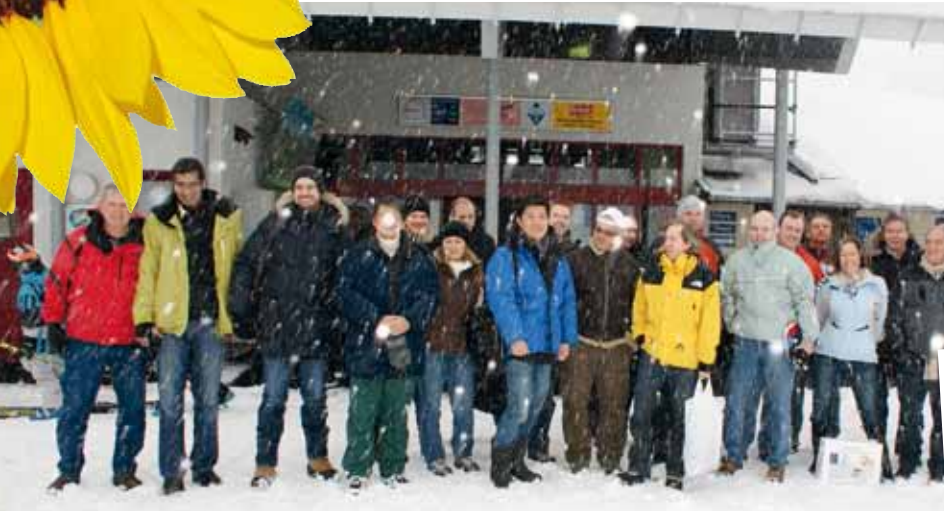
Global Sales Meeting 2011 with SCM Microsystems at 1,300 m above sea level