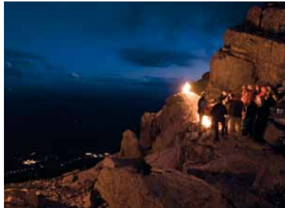
Sunrise walk – an unforgettable experience

From a cosy leisure walk to a challenging peak tour for mountain enthusiasts – our Hochgenusstour walks enable you to explore nature in various different ways. You can enjoy relaxed time together and walk across the Alpine meadows and past picturesque lakes through the breathtaking mountain landscapes. Here you will feel in complete harmony with nature. There will be time for relaxed discussions and any conflicts will be much easier to resolve as shared experiences create bonds. The combination of physical exertion, the power of the mountains and the fantastic feeling of satisfaction when you have reached the goal make it all worthwhile. And to re-charge your batteries en route, we provide culinary treats by an open fire or stop off at one of the numerous traditional huts for a hearty snack. Many of the huts offer the chance to stay overnight. This means that you can savour the dreamy unique mountain backdrop together even after your day in the mountains has come to an end. Our morning sunrise walks on the 2,444 m Kröndlhorn are a truly unforgettable experience in nature. We set off at 2.00 am with head torches, walking towards the skies. Night-time, tranquillity and the legendary nature; from time to time, you will hear the sounds of cow bells or the croaking of a crow. Once at the peak, your efforts will be rewarded: the first rays of sunlight signal the arrival of a new day and create a special lively ambience. The mountain world opens up before you in all its splendour.