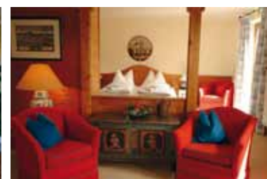
The Alpine chalet offers you an exclusive atmosphere for seminars and meetings